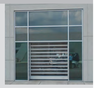
Nine-inch high vision slats for increased visibility