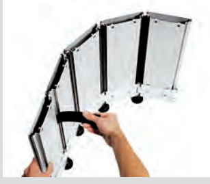
Integral rubber weatherseal