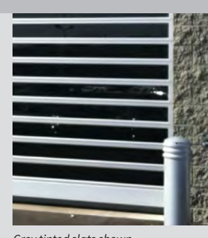
Grey tinted slats shown