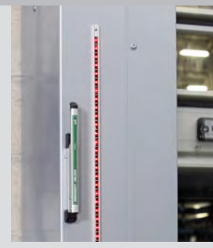
Pathwatch warning lights and brake release lever shown