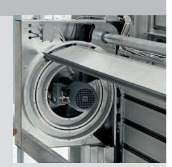
AC drive motor