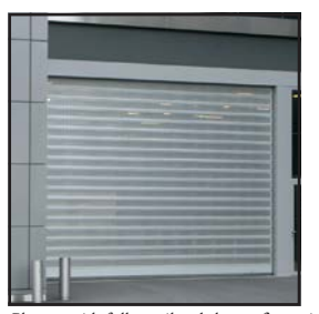
Shown with full ventilated slat configuration