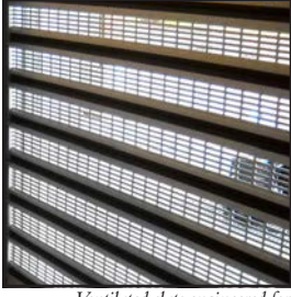
Ventilated slats engineered for maximum air flow