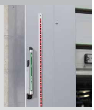
Pathwatch warning lights and brake release lever shown