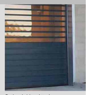
Optional vision slats shown