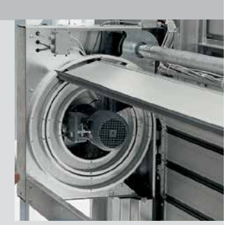
AC drive motor