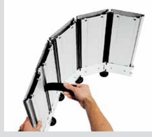
Integral rubber weatherseal