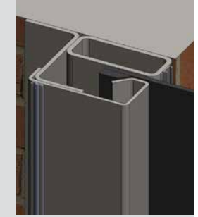
Side column profile