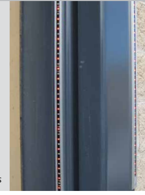
Pathwatch warning lights