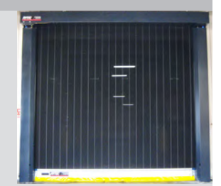
Full screen panel shown