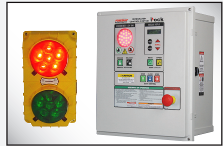
iDock Controls includes light communication and can be integrated with other dock equipment.