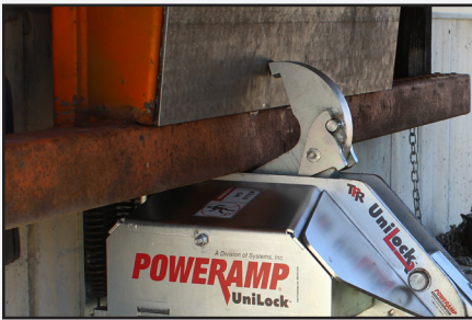
Locking mechanism maintains engagement even on intermodal trailers or an obstructed Rear Impact Guard (RIG).