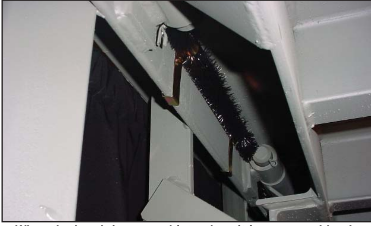
When the brush is pressed into place it is supported by the metal clips. The brush expands sealing the void between the rear header and the hinge where air and rodents could enter.

The Pro-Seal offers the quickest and tightest seal available. It can be positioned in the rear of the leveler in under ten minutes. The kit includes all of the necessary tools and equipment to completely seal the rear of the dock leveler, the hardest area to completely seal due to the odd shape of the rear hinge area. The Pro-Seal is positioned on top of specially designed clips which quickly snap into place using the patented clip tool included. After the brush is pressed into the rear hinge area, the seal expands, closing off the gap in the rear of the leveler. The specially designed tubular brush seals along every surface completely seals the rear hinge area, protecting your facility from air and rodent infiltration. The Pro-Seal is designed to be installed by anyone without the need for special tools or adhesives.