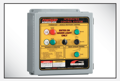
Dock Alert Communication System Control panel for automatic lights - manual light control panel similar.