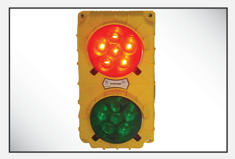
Exterior Lights - Incandescent standard with optional LED for longer life.