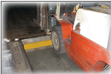
The barrier is designed to allow for end-loading at the loading dock.