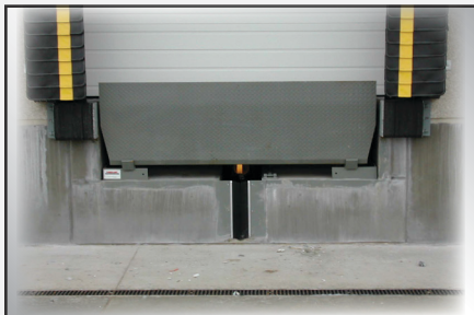
Add the Barrier Lip and combine with vehicle restraints for optimal safety.