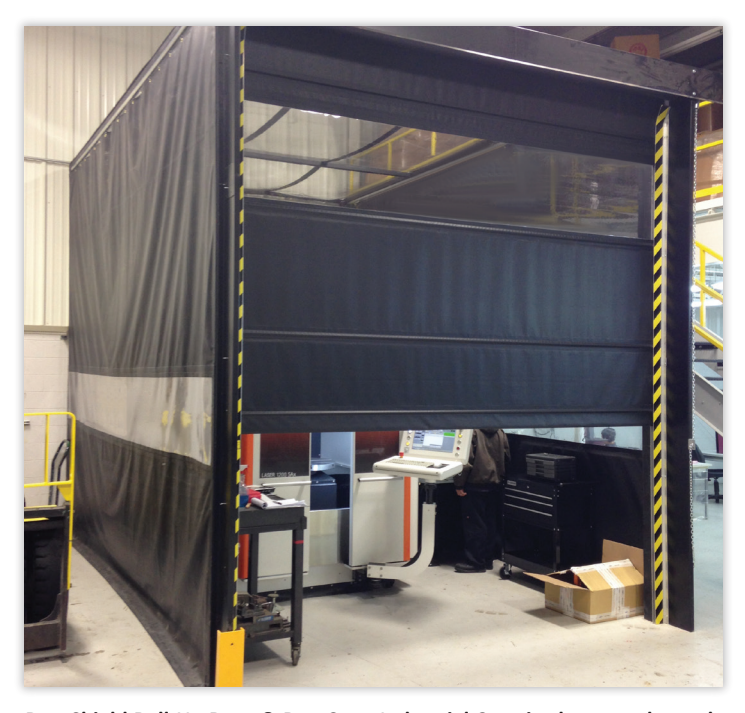
DuraShield Roll-Up Door & DuraSpan Industrial Curtain showcased together.