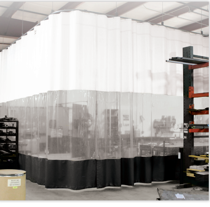
DuraSpan Industrial Curtain with translucent window.